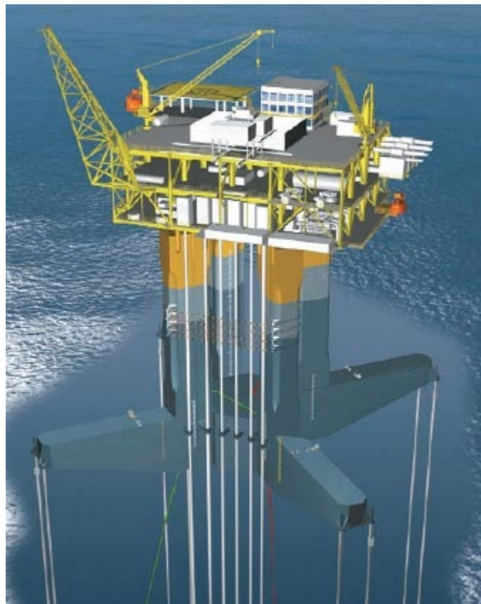
Sea Star Platform

These platforms are a larger version of semi-submersible design. But instead of anchors, they are connected to the ocean bed by flexible steel legs. These platforms usually operate in water depths ranging from 152 to 1,067 meters (500 to 3,500 feet ).