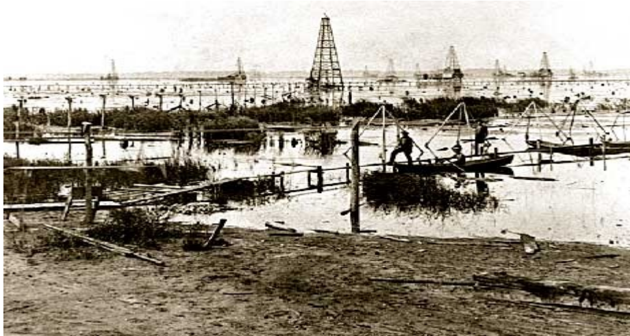
Oil wells in the Grand Lake St. Marys

Main types of offshore platforms include