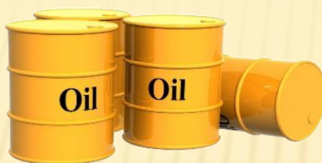
Estimated Production ۷ • MSTB/D oil