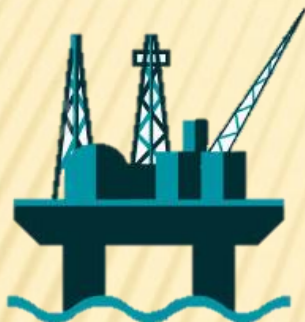
۳ Exploration wells